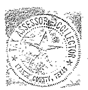
Tax Assessor-Collector Upshur County, Texas